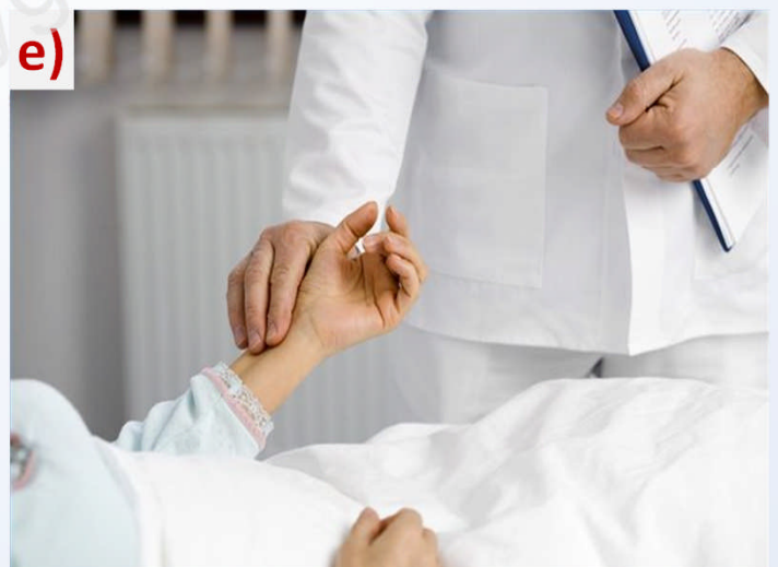
Figure 4: Healthcare Professional monitoring a Patient pulse

IV Care - An example of WHO Moment “2” or “3” – would this procedure trigger Inherent Hand Hygiene? If so - Can Human Behaviour ensure Healthcare Professionals automatically perform Hand Hygiene?