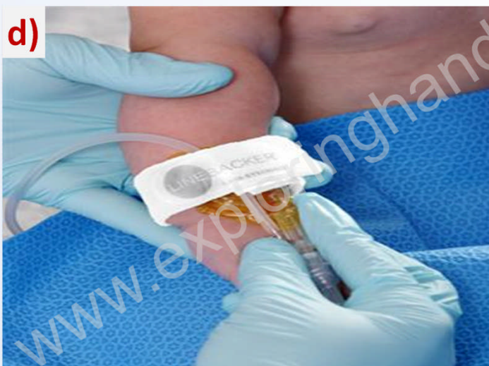
Figure 3: Healthcare Professional performing IV Care

Retrospective analysis is to be used to test the hypothesis that compliance rates will be higher for Inherent examples than for Elective examples. Focus will then turn to the potential for the role of technology (“If so” – Figures 3, 4, below).