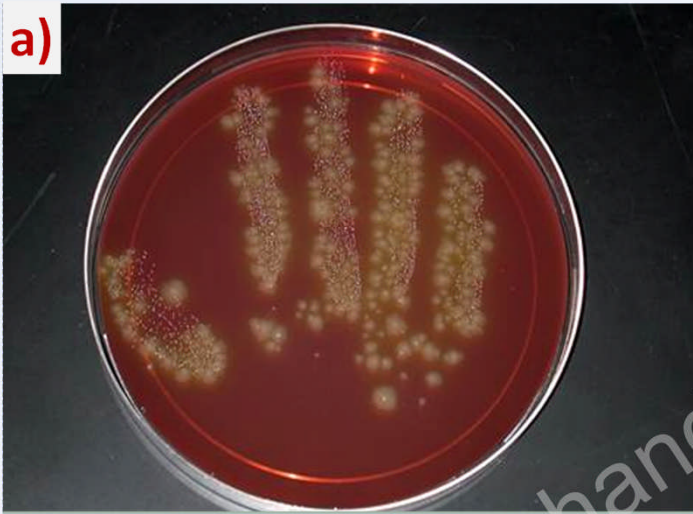
Figure 1: Hand print culture contaminated with C.diff spores